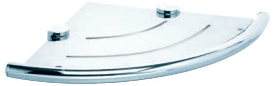
BA 718 Stainless Steel Corner Shelf 280mm x 280mm Polish Supreme