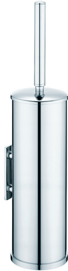
BA 750 Toilet Brush Holder Chrome