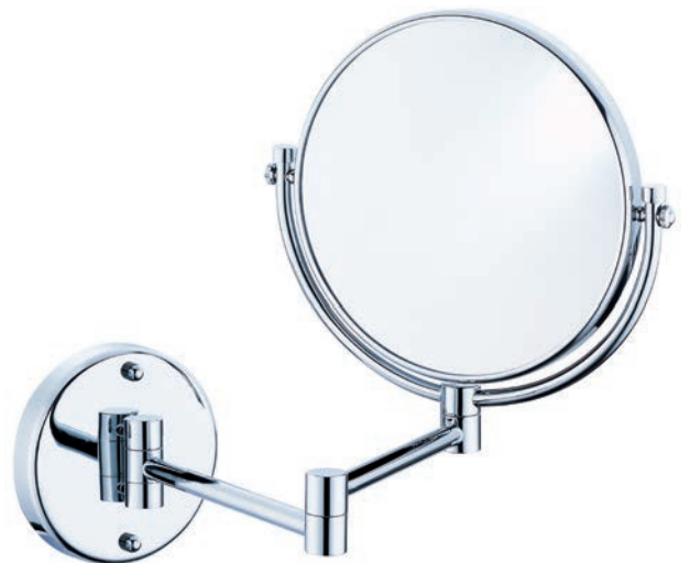
BA 780 Dual Sided Mirror Standard and 3x Magnification Chrome