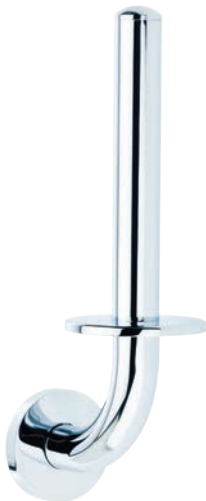
BA 721 Spare Paper Holder Chrome