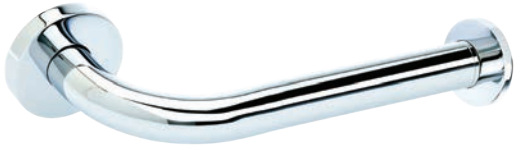
BA 712 Toilet Paper Holder Chrome