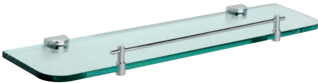
BA 729 Glass Vanity Shelf 530mm x 120mm Clear 10mm Tempered Glass Shelf with Barrier