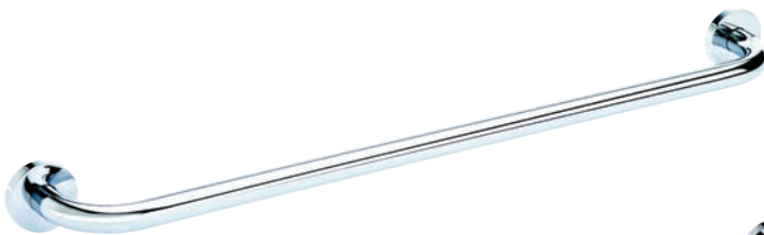
BA 704 Single Towel Rail 600mm Ø to Ø Chrome