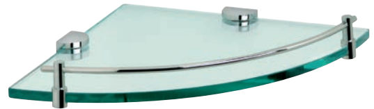
BA 739 Glass Corner Shelf 260mm x 260mm Clear 10mm Tempered Glass Shelf with Barrier