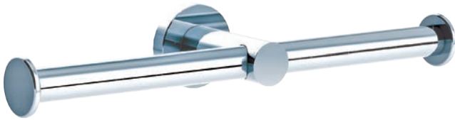
BA 722 Double Toilet Paper Holder Chrome