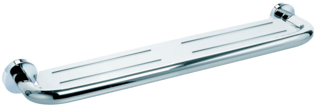
BA 708 Stainless Steel Shelf 500mm Ø to Ø Polish Supreme